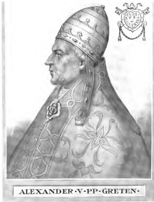
ALEXANDER · V · PP · GRETEN ·